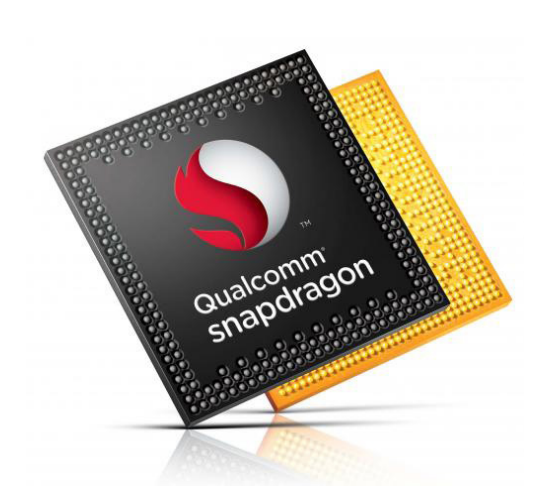
Figure 2. Qualcomm Snapdragon Processor [1]

One such example is the Medias X N-06E phone from NEC, the world's first water-embedded smartphone. At the heart of the Medias X N-06E is a quad-core Snapdragon S4 Pro SoC running at 1.7 GHz, that has its heat drawn away to the sides of the phone by a water-filled heat pipe. [1]