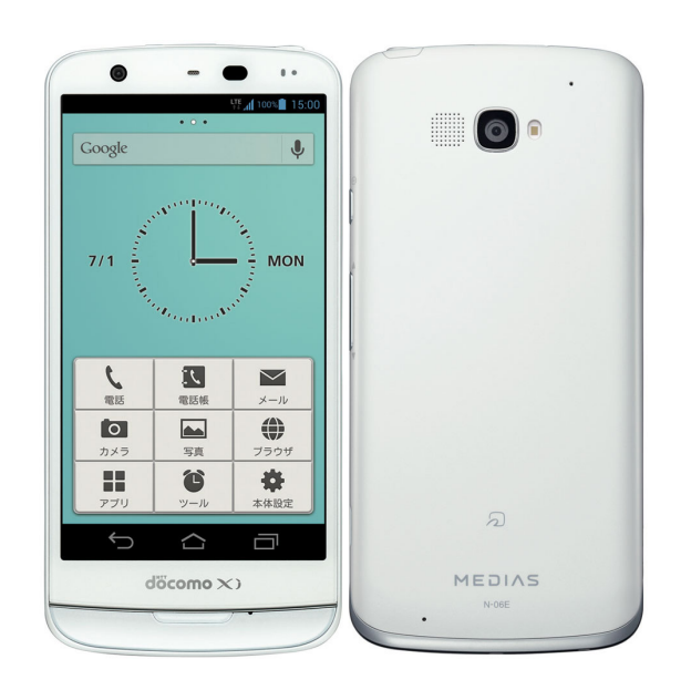
Figure 1. NEC's Medias X 06E Smartphone

With increasingly processor-intensive apps being used on mobile devices, the powerful chipsets in smartphones are running hotter than ever. Many desktop computers and larger, powerful computing systems use water cooling to keep their CPUs from overheating. Now, smaller versions of these cooling systems are being employed in warm smartphones.